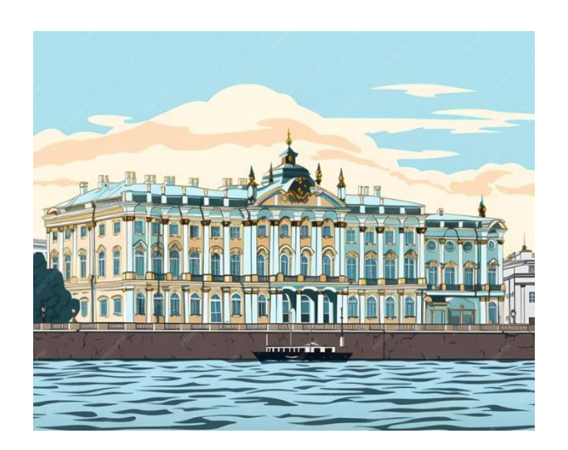
Organization of Partnership Between a Publisher (Serbia) and One of the Largest Museums (Russia)