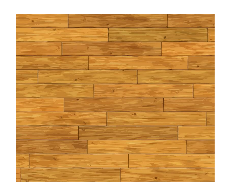
Organization of Cooperation Between a Wood Product Manufacturer (Russia) and Clients in Serbia