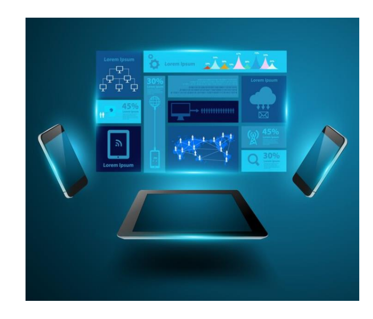
Launch of a Digital Platform (Kazakhstan) into the Markets of the Balkan Countries