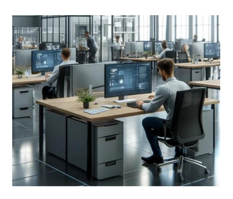
Entering International Markets for an IT Company and Obtaining Innovative Status in a Foreign Jurisdiction